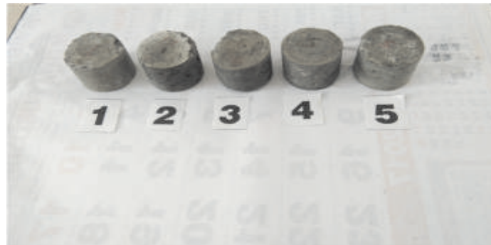
Photo Plate No.4 Shows concrete blocks processed from various foundry sands.

for curing and next day the concrete blocks were removed from PVC molds and labeled them. Then this separated concrete blocks were kept in water bath for 28 days for curing and then it was air dried (photo plate No.4) and its strength was measured with the help of compression testing machine (Ratnakar Enterprises Make, photo plate No.5).