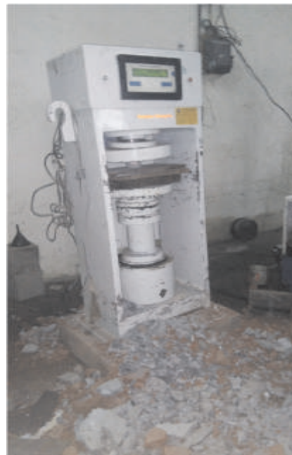
Photo Plate No. 5 Shows the measurement of concrete block strength of various foundry sand used.

From the point of view to reuse and eco-friendly use of foundry waste sand, Government organizations, private builders and other developers have to consider the scope, need and availability of foundry waste sand, they have to use this foundry waste sand in concrete construction which will be helps to solve the environmental problems as well as save the natural stock of river sand which is day by day becoming costly and scare. It also helps to preserve and protect river water and river ecosystem also.