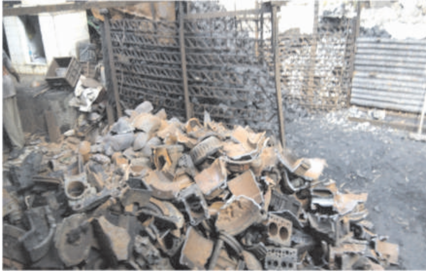
Photo Plate No.1 shows pig iron, scrap, coke and limestone used as a raw material in foundry industry.

For casting the job it requires the molds and for mold formation requires specific green sand which is rich in high quality silica (85-95%). Further this sand is charged with addition of 5-10 % bentonite (clay binder), 5 % Sea coal (Carbonaceous mold additive to improve casting finish) and 5% water and then it is homogenized with the help of mixture to make it ready for molds.