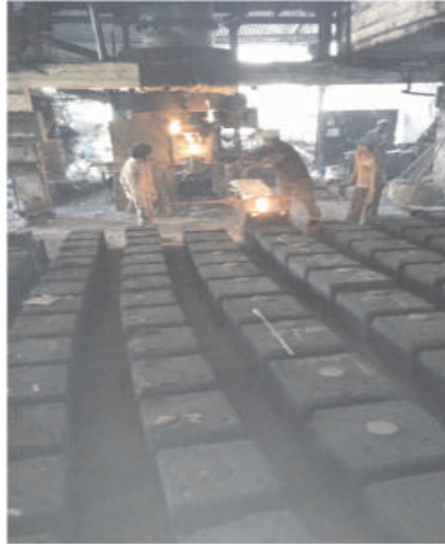
Photo Plate No.3 Shows molten ferrous material collection and pouring into sand molds.

sand and slag is unscientifically used for land filling or dumped on road sides which further becomes cause of air, water and ground water pollution. The leachate of foundry waste sand and slag is not directly harm to human and animal life but sometimes it harm to earth's environment and ecosystem. According to EPA (US), 2007, near about 6-10 million tons of foundry waste sand is generated per year and out of it less than 10-15 % waste sand is recycled and remaining huge amount of waste sand is damped on ground.