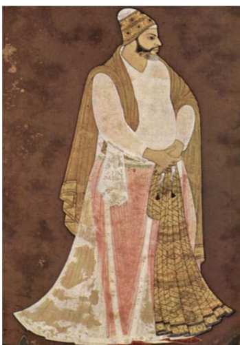
Muhammad Quli Qutb Shah