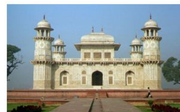
Figure 5 Calligraphy on Tomb of Itmad-Ud-Daula

Nur Jahan, the wife of Jahangir commissioned to build a mausoleum for her father, Itmad-ud-Daula at Agra. The building indicates transition from the Akbar's red sandstone to Shahjahan's white marble buildings. The central arch of the tomb has a band of white marble with relief work of calligraphy shows the use of calligraphy in design. There are nine panels of Arabic inscription on each facade and one panel on every side of polygonal minaret at the same level as shown in example ( Fig- 5 ).