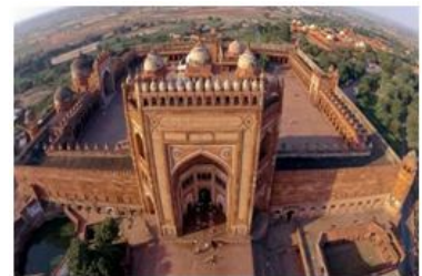
Figure 3 - Calligraphy on Buland Darwaja

In the Interior of Qila -e-Kuhna Mosque all bays have decorative niches in qibla wall. The south most and north most niches are decorated with calligraphic arched sandstone panels sandwiched between outer border and inner panel of white marble. All the calligraphic style used here is Naskh as design. After winning Gujrat Akbar built a victory gate known as Buland Darwaza, a south entrance to the great mosque of Fatehpur Sikri (UP). The gate has beautiful design in the form of inscription in carved relief work on sandstone ( fig.3-Buland Darwaja ). The calligraphy on this gate is in Thuluth script and calligrapher mentioned his name as 'Husain bin Ahmad al Chishti'.