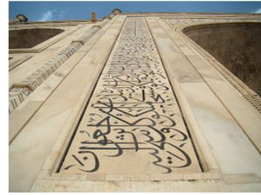
Figure 6 Calligraphy on Taj Mahal Gate

white marble is famous for its well versed decoration with arabesques, geometrical patterns and calligraphy. At the southern arch of the interior of the tomb, a signature was marked with date by calligrapher mentioned himself as 'Amanat Khan Shirazi' the calligrapher had already been worked for Akbar's tomb where he mentioned his real name 'Abdul Haq' while signed on an inscription at its gateway. Most of the inscriptions are Persian at Akbar's tomb in comparison to Taj where the inscriptions are from Quranic verses (shloka). It is presumed that the selection of verses and surah to be inscribed on the monuments was done by the calligrapher (Begley, 1975).