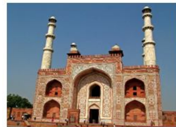
Figure 4 Calligraphy on Akbars Tomb

Jahangir the Akbars son made many changes to the original form of Akbar's tomb located in Sikandara Agra. Elegant white marble decoration at the entrance gate to the tomb shows Jahangir's involvement in design. The inscriptions on facades of the gate are in both in Persian and Arabic languages. It contains the praising words for emperor, modified quotations from Quran and on the last panel name of the calligrapher with date is mentioned in ( Fig - 4 ).