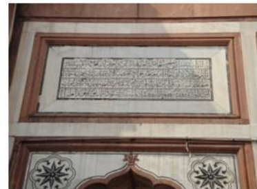
Figure 7 Calligraphy on Jami Masjid, India

According to sources it is said that Mughal emperor Shah Jahan built Jama Masjid during the year 1650 to 1656 AD Jama masjid is also known as the Masjid-i Jahan Numa of Delhi, is one of the largest mosques in India. It was constructed with the help of 5000 labours. It was built up by the Mughal Emperor Shaha Jahan. The courtyard can accommodate more than 25000 people at a time. On the floor of Jama masjid total 899 black borders are marked for worshippers. Shahjahan shifted his capital from Agra to Delhi in 1638 and planned a new city named Shahjahanabad. The jami Masjid was proposed near bazaar to serve the population of the city. They are written in Tughra design of Thuluth script. All the small arches have inscriptions above on white marble panels inlaid with black stone. They put up with information regarding the history of building, construction duration, cost, name of builder and calligrapher. These panels put up with Persian prose and Quranic verses. It shows that Islamic calligraphy is used broadly to decorate the interior and exterior walls of the Great Mosque can be seen in other examples:-