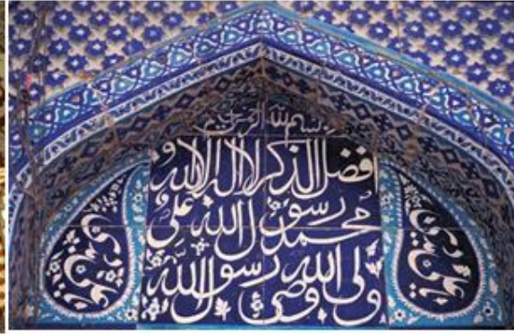
FIGURE 2 CALLIGRAPHY ON MOSQUE-SHAHDAH