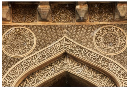
FIGURE 3 CALLIGRAPHY ON BADA GUMBAD