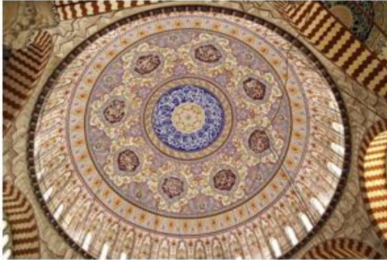
FIGURE 1 CALLIGRAPHY ON MUGHAL SELIMIYE MOSQUE DOME