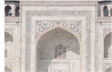
Figure 2 Calligraphy on Taj Mahal, India