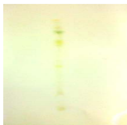
Figure : TLC of Ethanol Extract