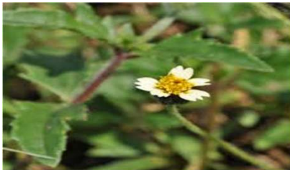
Figure : Tridax Procumbens Plant

Tridax Procumbens is common plant found in Tropical areas of all Countries, growing primarily during rainy season. [11] Infact, the plant is native of tropical America and naturalized in tropical Asia, Africa, Australia and India.