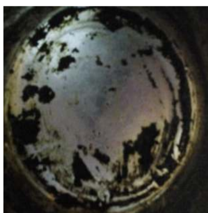
Figure : Ethanol extract

The plant leaves of Tridax Procumbens was packed in the Soxhlet apparatus and extracted with Ethanol as a solvent. The extraction was carried out for 72 hrs at 79°C temperature. Later on, the extract was kept over the water bath for getting pure plant leaves extract. After the formation of extract TLC (Thin layer chromatography) method was performed for separation of medicinal compounds and by the help of IR Spectroscopy we can interpret the compounds.