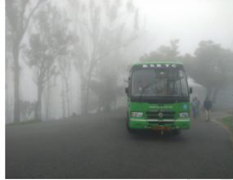
Check post bus stop area GH hills bus stop area