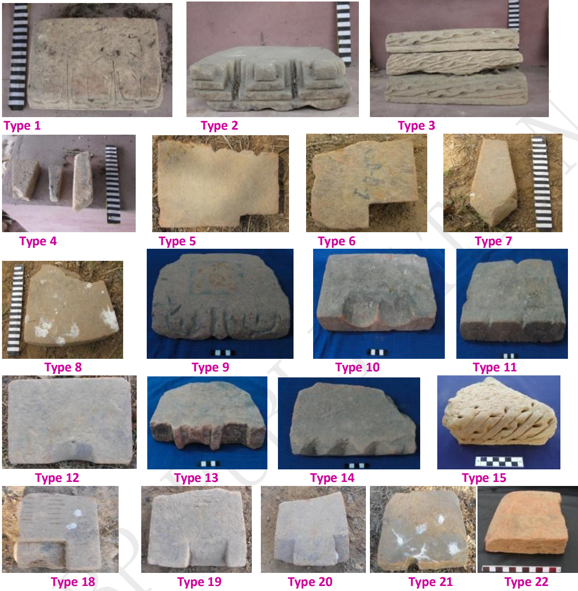
Table 8. Table Depicting Occurrence Type of Moulded Bricks.