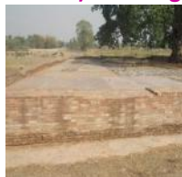
g) Surya Pahar