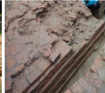
c) Kakoijana (Bongaigaon)