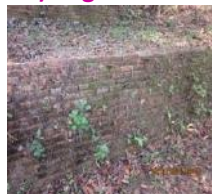
f) Na Nath No.7