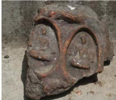
a) Paglatek, Goalpara