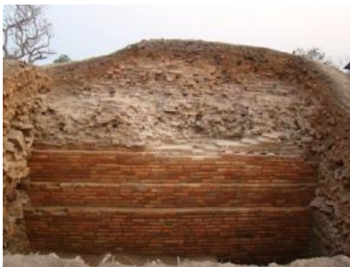
a) Garh Dou (Tezpur)