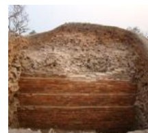
i) Garh Doul