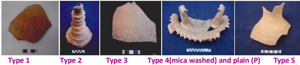
Table 9. Occurrence of Few Common types of Pottery in Assam Sites