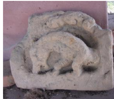
b) Bamgaon, Bisnath