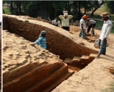
b) Moghalmari (WB)