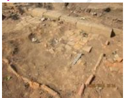
e) Madan Kamdev