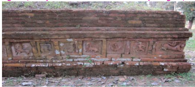
c) Na Nath, Hojai

Moulded bricks are important building material for ornate and elaborate brick edifices. Structurally they have the similar uses like general bricks as they are same building blocks with weight bearing properties. The use of these bricks is to beautify the outer walls of the structure. Elsewhere in Bihar, Bengal, Tripura, Bangladesh and Myanmar moulded bricks are profusely used in construction during 8 th to 12 th century. Moulded bricks are employed for two purposes, structural and decorative, sometimes serving both functions. Moulded bricks are mostly used on the outer face of the structure at its basal part. Due to the elaborate nature of their structures, brick was preferred in the Buddhist construction.