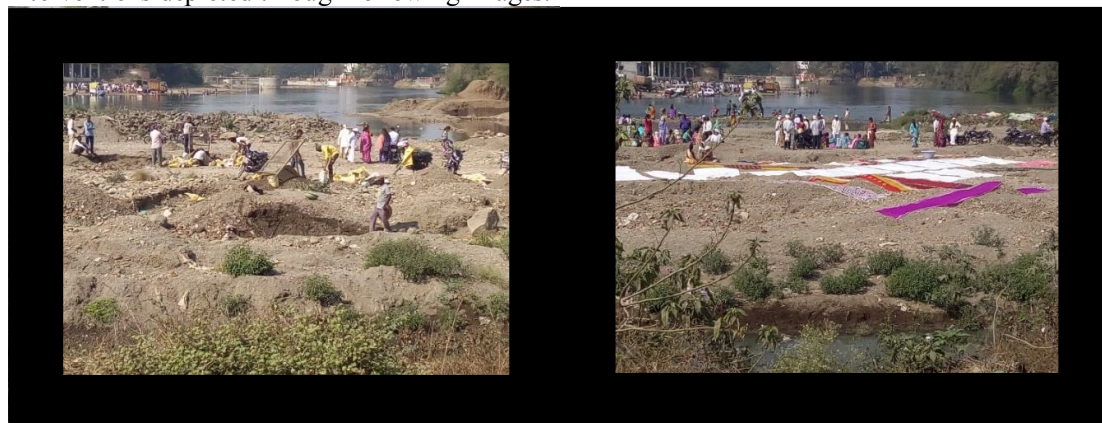
Zone I Instream Construction Zone III Domestic & Rituals activities

Field observations revealed Zone III is more affected due to domestic activities and in-stream construction. Zone IV is a concentration of brick making activities that it worsen the environmental condition and degrade the social status. Many other human activities along river like construction of dams, diversion of channel, removal of vegetation, Instream agriculture , religious activities, sand mining pose a concerned impacts on river and socio-economic condition of the region, so study would be useful for creating awareness among local peoples, farmers and miners that may prevents further degradation of water resource. All interventions depicted through following images.