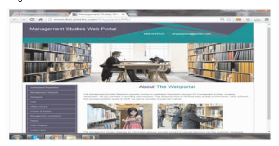
Figure 1: Home page of the Management studies Portal

Design of Web Portal: After creating the databases and deciding the hardware and software requirements, the prototype portal design process commenced. The web portal has been named as management studies portal which stands for management and business administration information.