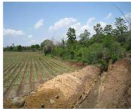
Unplanned trench at Muddanahalli village