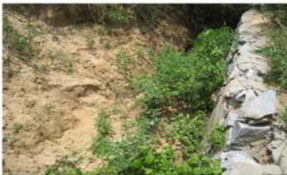
Elephant proof wall constructed with substandard material at Uthenahalli