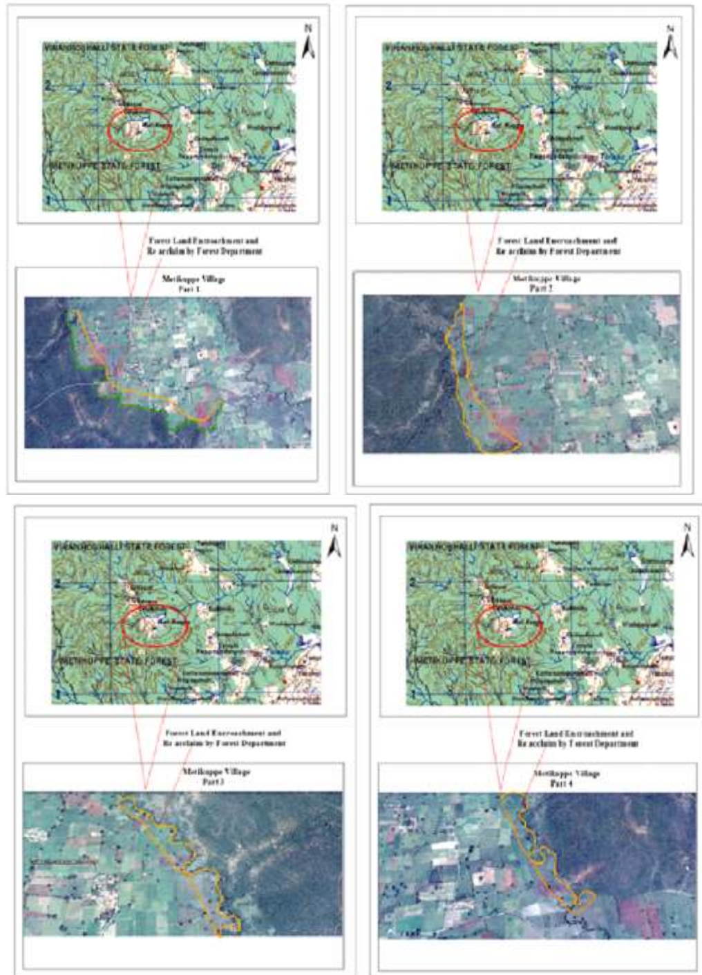
Map no: 1 Forest land encroachment and re-acclaim by forest department

even their lands may be acquired by the forest department if they join the protest. This issue has become most sensitive and created instability among the farmers of adjoining forest fringe villages. As per the survey the farmers are also ready to give up (SHEKHAR SINGH, 2006) their land if the government pays compensation with land at other place to make their livelihood. See graph showing farmers the willing to give up their land.