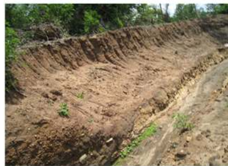
Unplanned trench at Alalor village