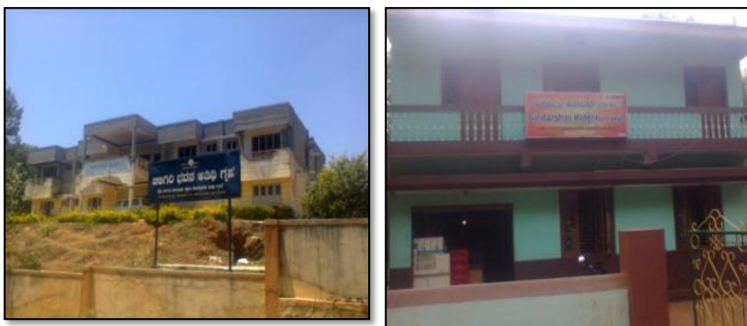
Sources: field visit -Hotel and Accommodation

Accommodation for visitors at hill station like lodges and resorts are in very good condition but available at very high cost for staying purpose. There is no accommodation at affordable rate to visitors. Some list of accommodation places are Biligiri Bhavana, Giri Darshini, Akasha Resorts, Gorukana Resorts, Rajathadri Resorts, and Champaka Resorts.