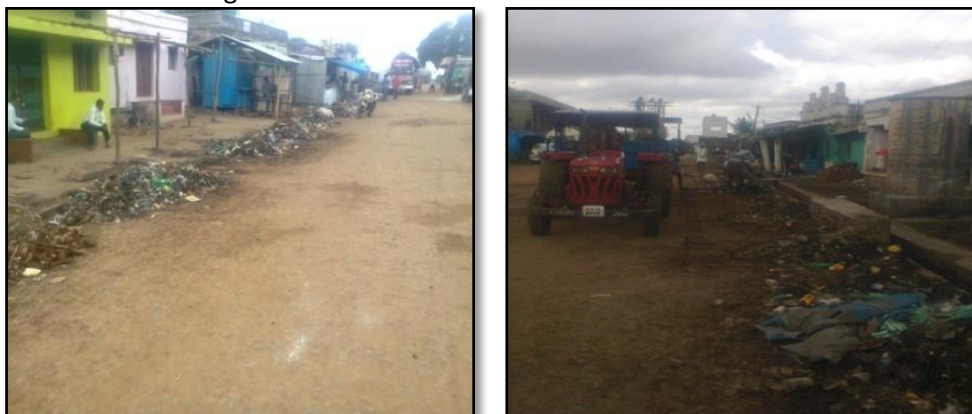
Sources: Field visit- After drainage cleaning

Drainage system for waste water at the hill station is maintained properly. The proper delivering of sewage water from one place to drainage easily during rainy season, the hill stations can be seen with drainages constructed to flowing to down wastewater.