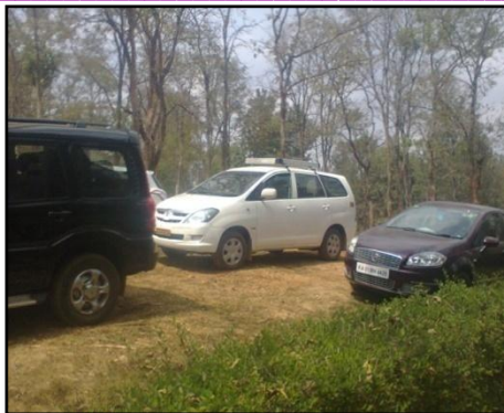
Sources: Field visit - Parking facilities