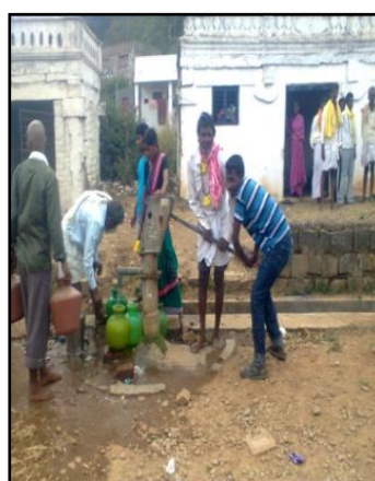
Sources: filed visit –Facility of Water supply stand tank and hand pump