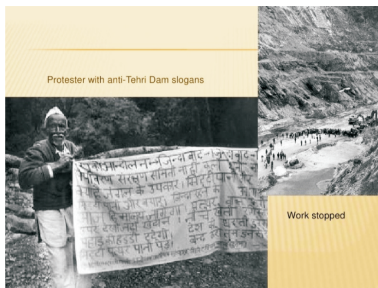
Picture 2 A protester with anti dam slogans