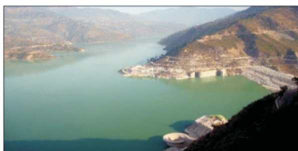
Picture 1 Tehri Dam

Further implementation of the dam was taken ahead by joint venture of Central government and the Government of UP. Here on the share of equity investment was decided upon as 3/4th by the Central Government and 1/4th for the state government in the Hydropower component, whereas the irrigation component was agreed to be financed solely by the state government of UP (Picture 1). It was in 1990 that the project was revised from initial 600MW to new 2400 multipurpose