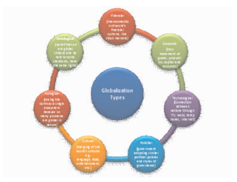
Figure 1: Types of Globalization

For the study we are mainly concerned with Economic Globalization as Market Globalization or Global Markets stems out of it. Economic Globalization involves the following: (i) Intercontinental exchange of products, services, and labour, (ii) Consumers worldwide use similar products made by the same corporation, (iii) Economies around the world develop greater capability to produce and export goods as they obtain capital, technology, and access to distribution networks, (iv) Movement of people and the exchange of ideas;eg. Software and Hardware Engineers from India, Germany, China, Japan work for software companies in US.