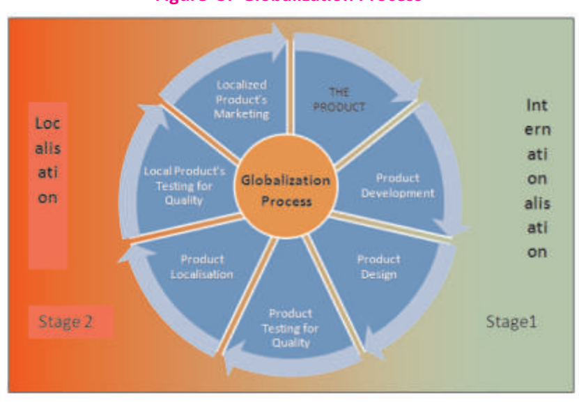
Figure 3: Globalization Process

As shown below in Figure 3, one of the biggest challengebefore global players it to move from internationalization to localization. The company has to come up with a world class product with quality assurance, localize it to tailor its appeal to individual markets they wish to sell in with the quality control of their localized product and with appropriate local marketing mix approach the customers.