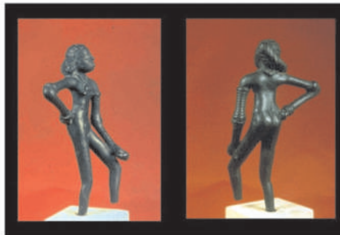
Fig. 5 Dancing Lady of Indus Valley Civilization.

Dancing seal: The unicorn is as if in singing ecstasy. Could it be their national anthem or the anthem of unicorns? 5 We can relate to its religious origin only if can successfully relate it to ancient times of India keeping in mind their barter value, their profitability and also the fact that these seals were not found near any temple of IVC.