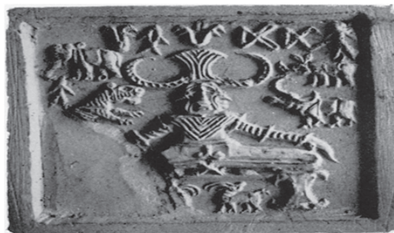
Fig 2. Pashupati Nath of Mohan Jodro

It is strange that the gaze of the unicorn is perverted towards the sky like soul's gaze of human beings and a disembodied head in the extreme centre. Maybe that is why unicorn is exhibited like human beings and human beings are exhibited like unicorns, mute in their body language. Valley people too have tail like structure on their head. Another mimesis of unicorn. And again unicorn as a mimesis of men: it wears ornaments, has a tail (which is longer than its body which is a question of evolution) (see the Fig 1.)