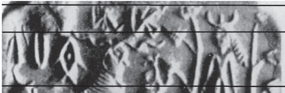
Fig 7. Stylistic Variation in the presentation of signs: Seal from Mohonjo Doro

For the one who reads these images of IVC it ignites the desire for searching some proper meaning, a ground, as one is governed. Every time one tries to decipher this, IVC irritates the remembrance of impotence, decapitation and the seed, desire for the seed, and limits of semiotics, gestures, anthropology and psychology---The Real and Horrible Aporia. It also cautions us that to what extent generalized reading can be dangerous. Nothing to construct, nothing to deconstruct here.