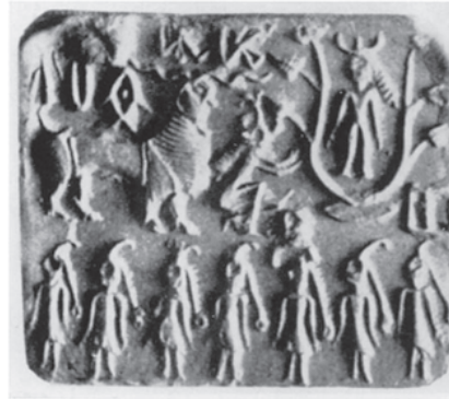
Fig 1. Seal from Mohon Jodro

Unicorn is not cruel, it is not carnivorous, it cannot gaze authoritatively at the sculptor. Unicorn is also incapable of languages understood by human beings. It is almost impossible, for sure, for IVC to recognize the vowels and consonants of Unicorn's speech. As Unicorns to Indus so Indus to Us. For us Indus is no more than the Unicorn. But Unicorn is exhibited like Human Beings. Unicorn as a mimesis of men: wears ornaments, has a tail (which is longer than its body). These seals make us impotent or reflect the impotency of its sculptor. There is no sculptor but unicorn as sculptor. We must name it 'No Sculptor.' Unicorn's head upwards as if in sexual ecstasy in a reverie: Dream-walking unicorns.