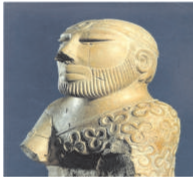
Fig. 3 King of Harrapa.

But who is the guiding gaze, the Sun in it? Could it be the Creator of these seals who attested the moment? Do we still expect proper names of these people? Can we name/derive one except for Harappa (which we have derived with our own logic)?