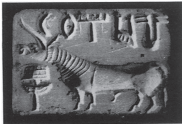
Fig 4. The Unicorn of Indus Valley Civilization (Coomaraswamy 28).

Graphic theme of glaring memory in these images, memory of concavity of signs: Seal of Pashupati Nath must be having visions of the man, a man who dared to look in the eyes of others with his six eyes, a man into whose eyes others wanted to look ( with or without hope), a man having two eyes, a man who is afraid to talk and